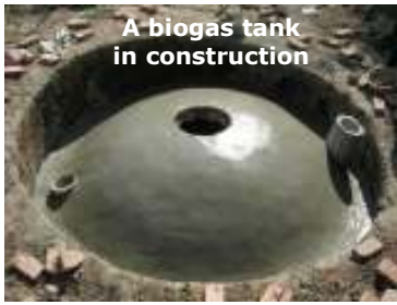
A biogas tank in construction

Biogas is a technique aimed at producing methane and at protecting environment.